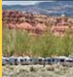
Torrey/Capitol Reef Rally 2019.

THE FOUR CORNERS UNIT IS A CHARTERED UNIT OF THE WALLY BYAM CARAVAN CLUB, INT'L. ALL ORIGINAL CONTENT COPYRIGHT © FOUR CORNERS UNIT, ALL RIGHTS RESERVED