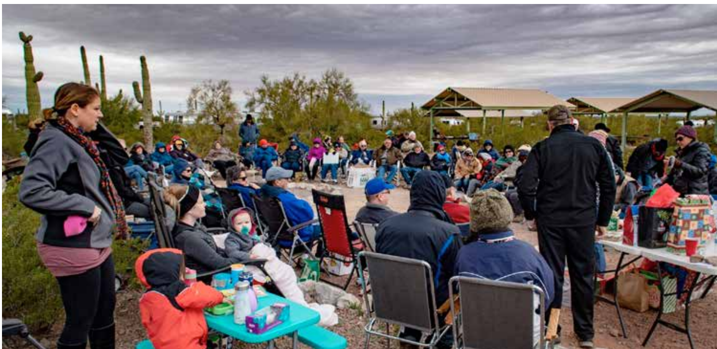
2019 - NEW YEARS - PHOTO :ROBERT JACOBSON