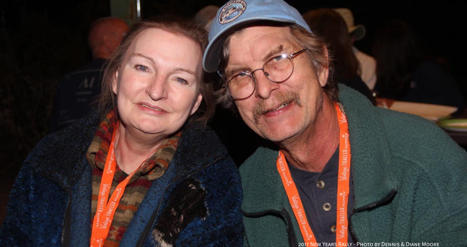
2017 NEW YEARS RALLY