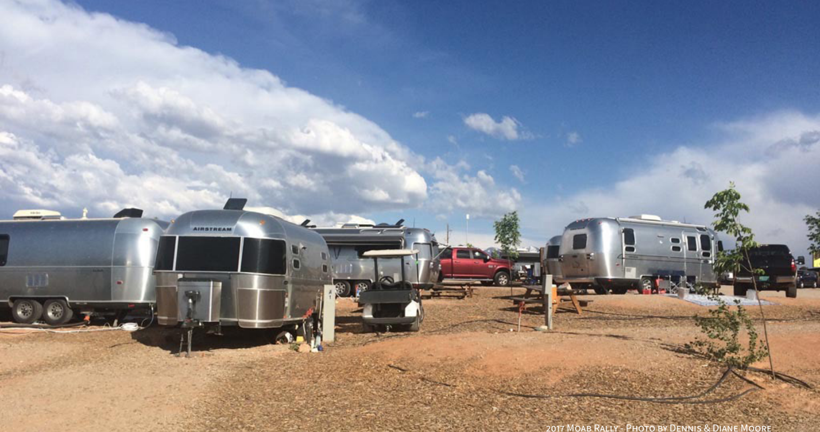
2017 MOAB RALLY - PHOTO BY DENNIS & DIANE MOORE