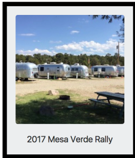
2017 Mesa Verde Rally