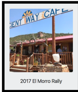
2017 El Morro Rally