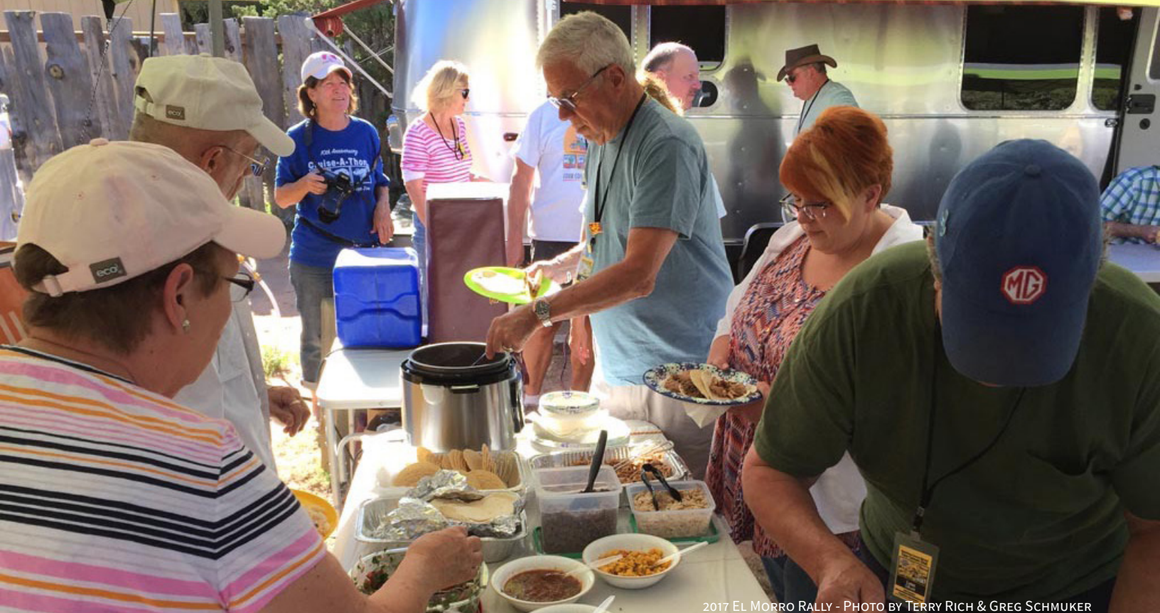
2017 EL MORRO RALLY