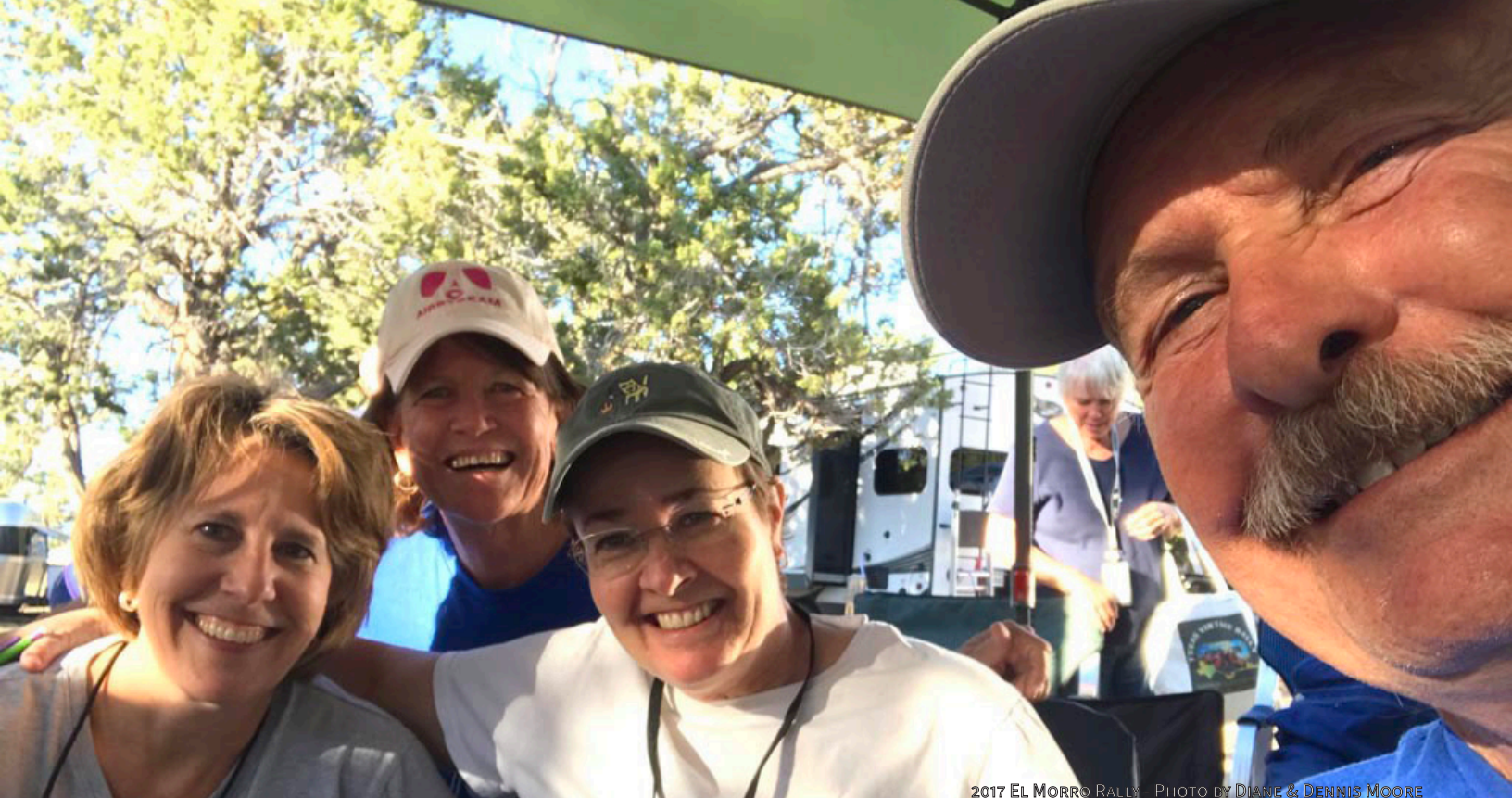
2017 EL MORRO RALLY