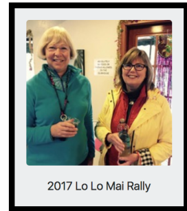
2017 Lo Lo Mai Rally