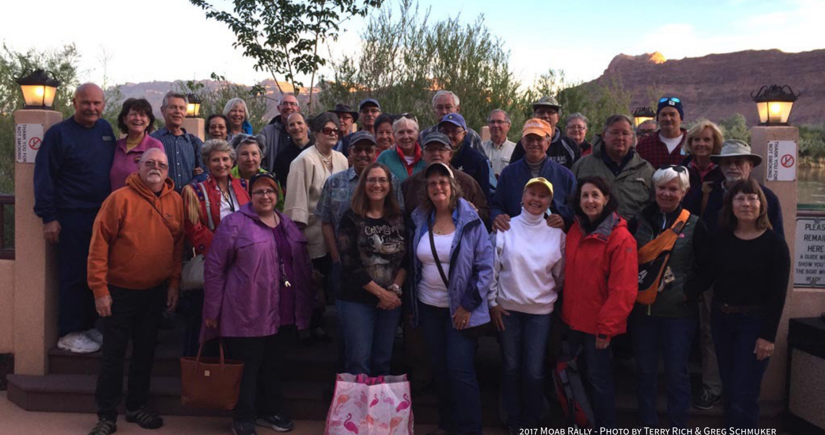
2017 MOAB RALLY - PHOTO BY TERRY RICH & GREG SCHMUKER