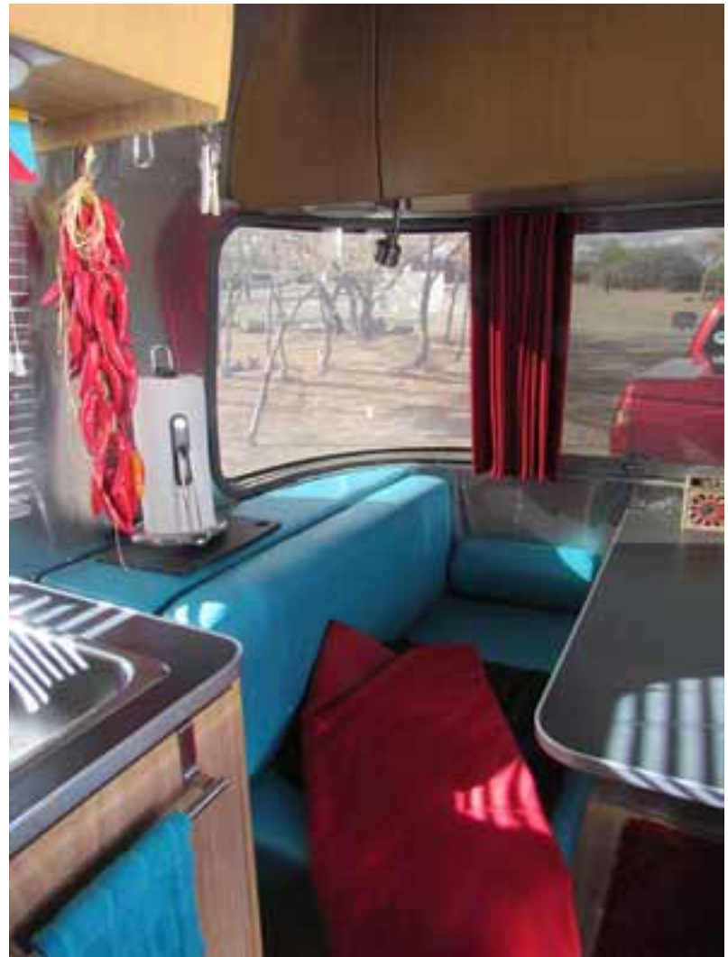
Celebrate The Horse

We have included pictures of some of our Pendleton interiors to show you how stunning this approach can be and to inspire you to make your rig your own! And as nice as it is, before you rush out and put your hard earned money down to purchase The Pendleton Special Edition trailer, consider what you might do to dress up your current rig. Granted, Greg & Terry have the advantage of Greg's skills, but remember — you don't have to be a sewing wizard to add accent pillows, throws or bedspreads. Be creative, use your imagination and above all — have fun! It makes for happy Airstreaming!