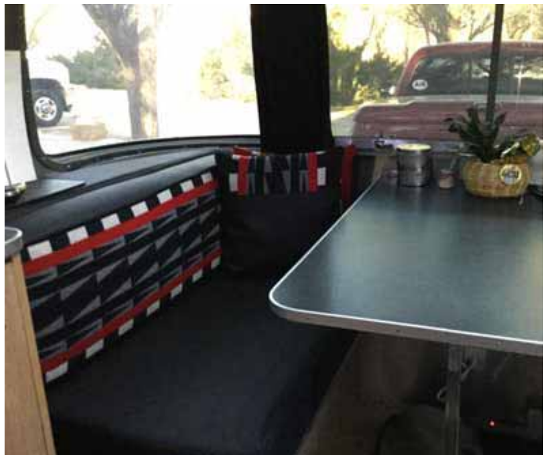
Hidatsa Earth Blanket