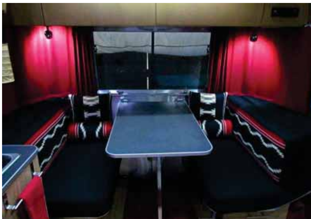
Navajo Water Blanket