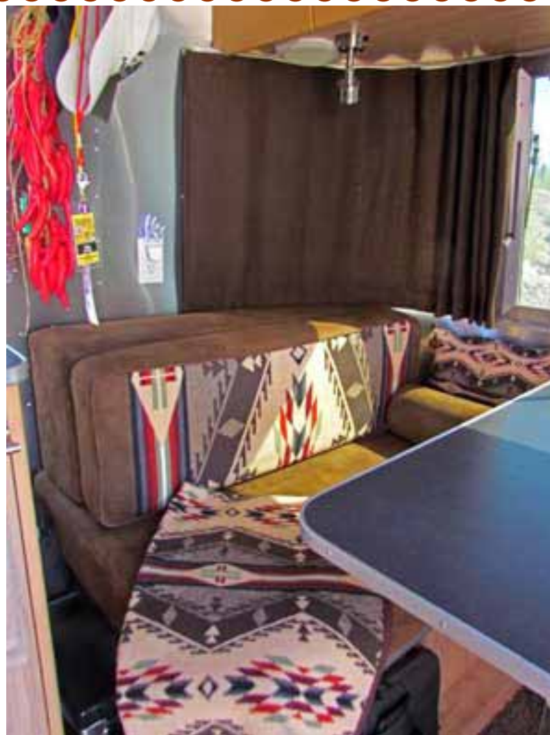
Spirit of the Peoples

The process goes something like this... Greg finds a Pendleton Blanket that he is particularly struck by ... he has a few sources, including eBay. The first blanket is a twin-size (64" x 80" — a perfect size for corner bed bedspread in a Bambi) and is left intact to be used for the bed cover. Then he finds a second matching blanket to create the accessory pieces. Because each design is different, a lot of planning goes into it before the first scissor cut is made (while Terry cringes). He uses the 2nd blanket to make the insets for the dinette back cushions and double pillow sham, and remnants to create accent pillow covers and window valances. Nothing is wasted! Sometimes he's lucky and can find open yardage or remnants of matching fabric (rather than full blankets). He uses complimentary solid fabrics for the panoramic curtains and pillow backs, and matching fabrics and/or vinyls for the dinette seats.