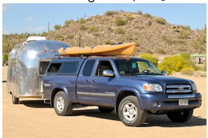
Ready for Lake Pleasant