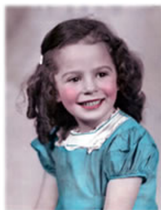
princess of the road