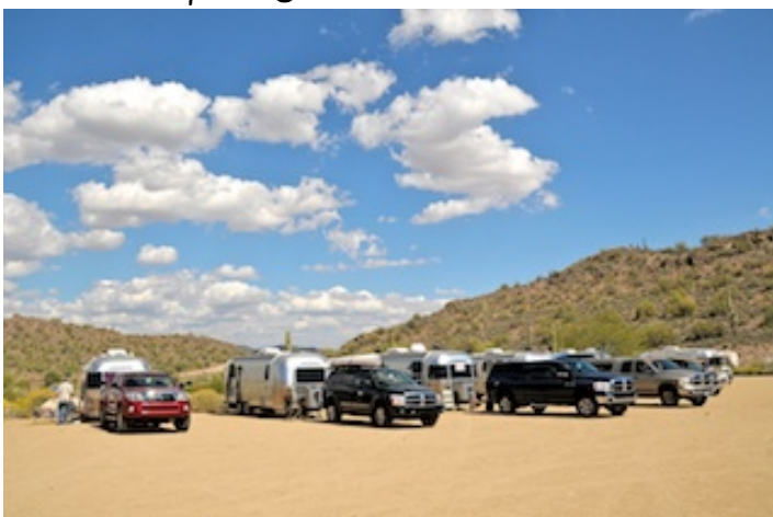
A beautiful Spring day!