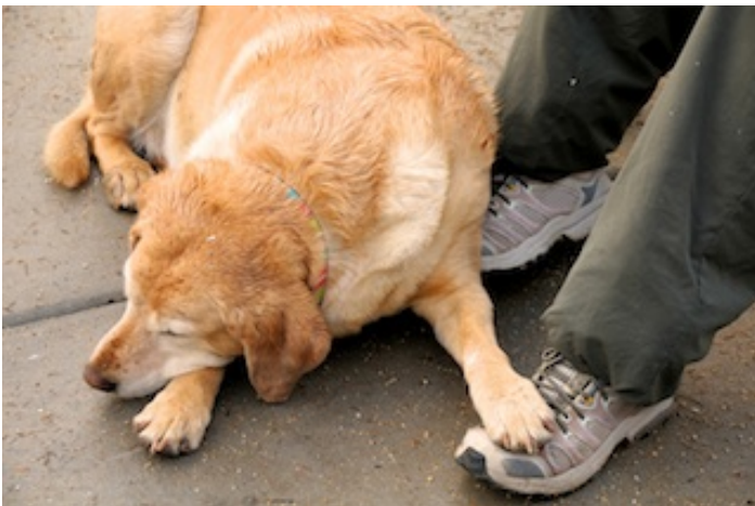
Save This Seat Foot!