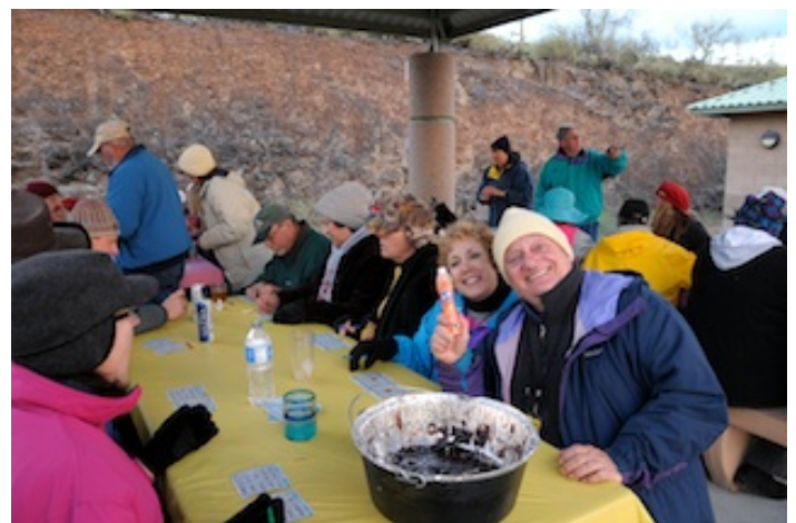
We Have A Winner!