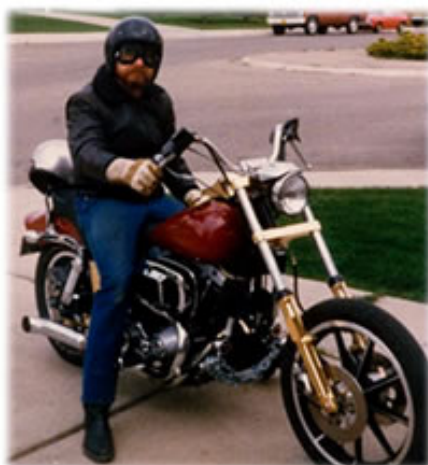
born to be wild