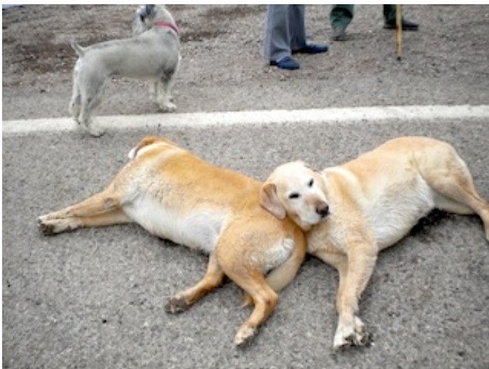
Dog's Break at the Lake