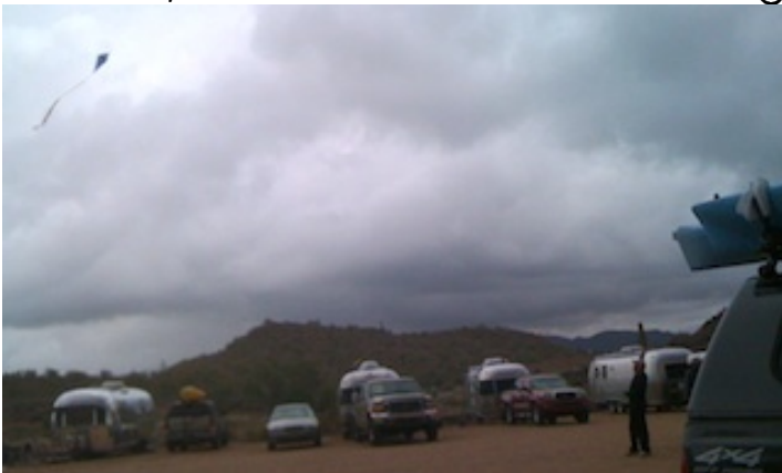
Kite Flying in the Clouds