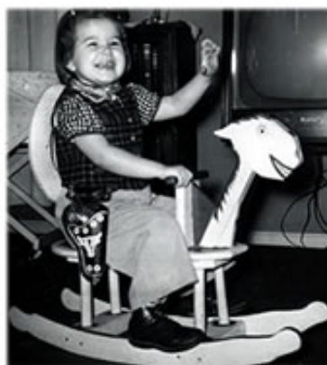
Dead Horse rallier