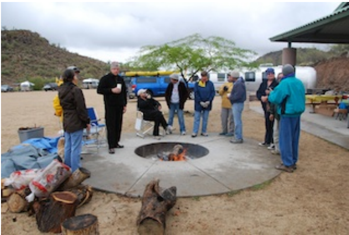
Morning Around the Fire Pit