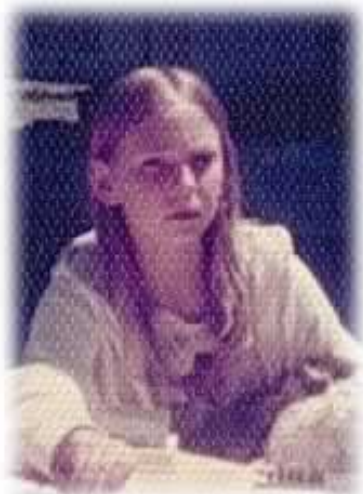
seriously happy camper