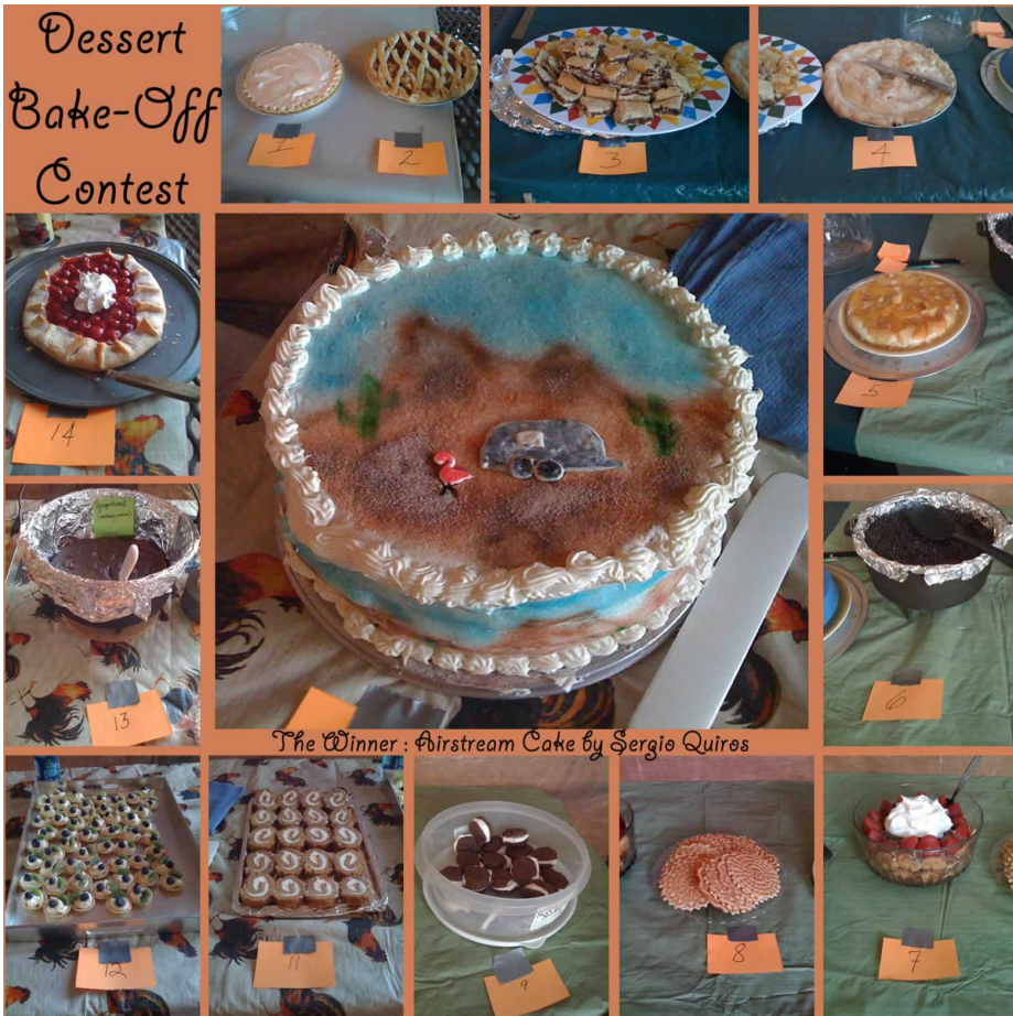
The Winner: Airstream Cake by Sergio Quiros

of 14 extravagant-looking desserts. Of course they ALL had to be sampled in order to vote! The winning entry of the Dessert Cook-Off was Sergio's delicious, beautifully decorated cake!