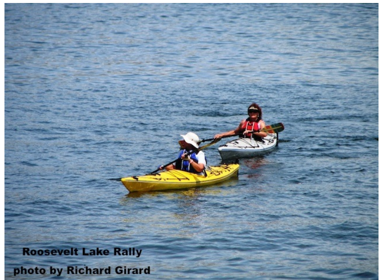
Roosevelt Lake Rally