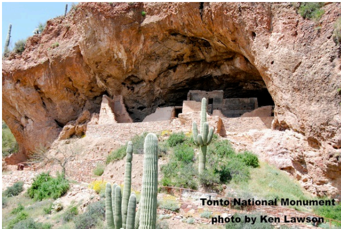
Tonto National Monument

The Tonto National Monument is near the Park, and this was a nice hike up to some ancient ruins that many members took. The ruins themselves had just been fumigated for bee hive removal, and so were closed to hands-on visiting, but they could still be seen from the trail leading up the monument site.