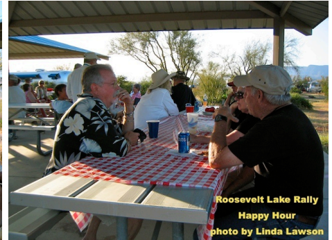
Roosevelt Lake Rally Happy Hour