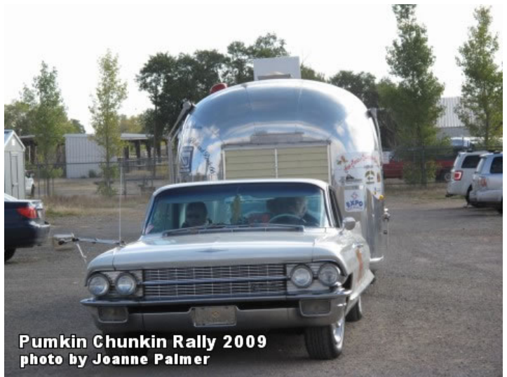
Pumkin Chunkin Rally 2009