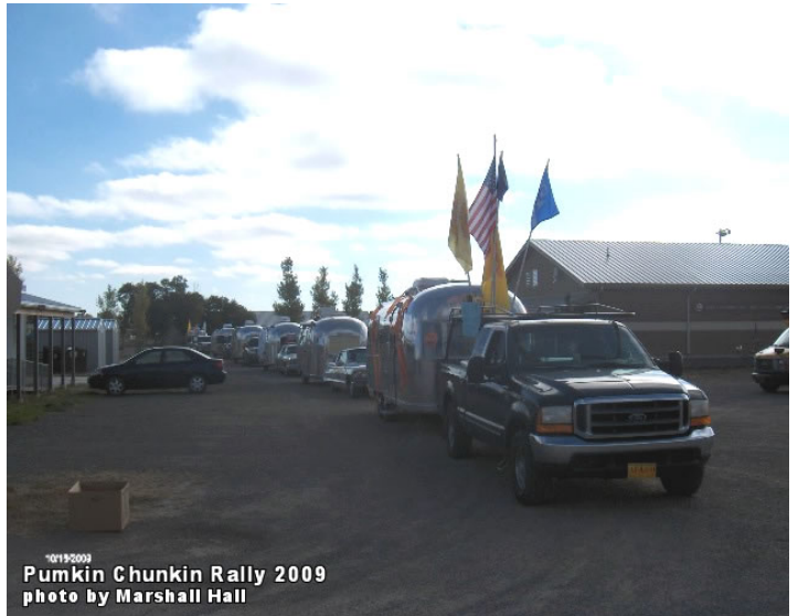
10/19/2009 Pumkin Chunkin Rally 2009