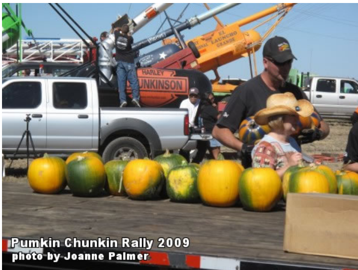
Pumkin Chunkin Rally 2009