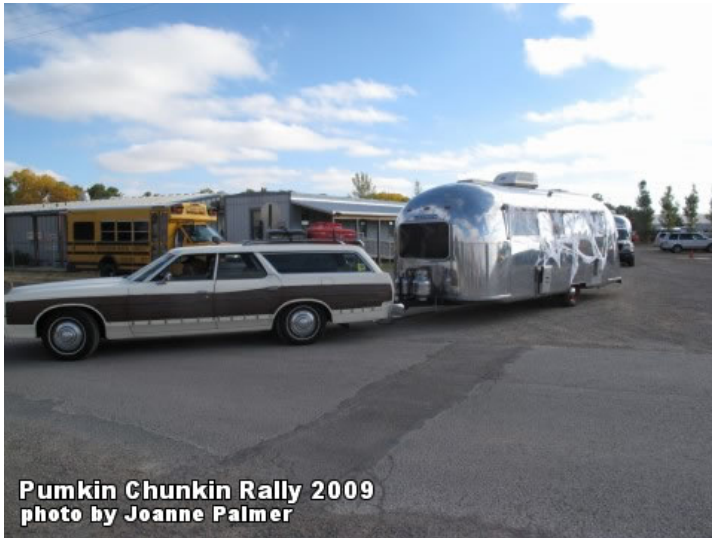
Pumkin Chunkin Rally 2009

P.S. Pumkin Chunkin has it's own facebook page - "Estancia Pumpkinfest" - it's worth a peek and also has more photos!