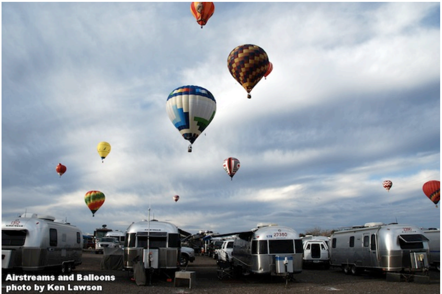
Airstreams and Balloons

Many thanks to the following contributors; they made this newsletter possible!