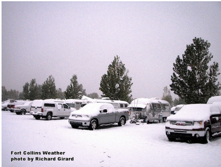
Fort Collins Weather