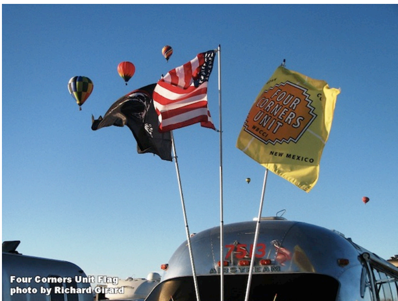
Four Corners Unit Flag

We were on the road for 15 days and covered over 2,000 miles. We had to replace one tire and one ice chest, but that's a story for around the campfire.... Richard