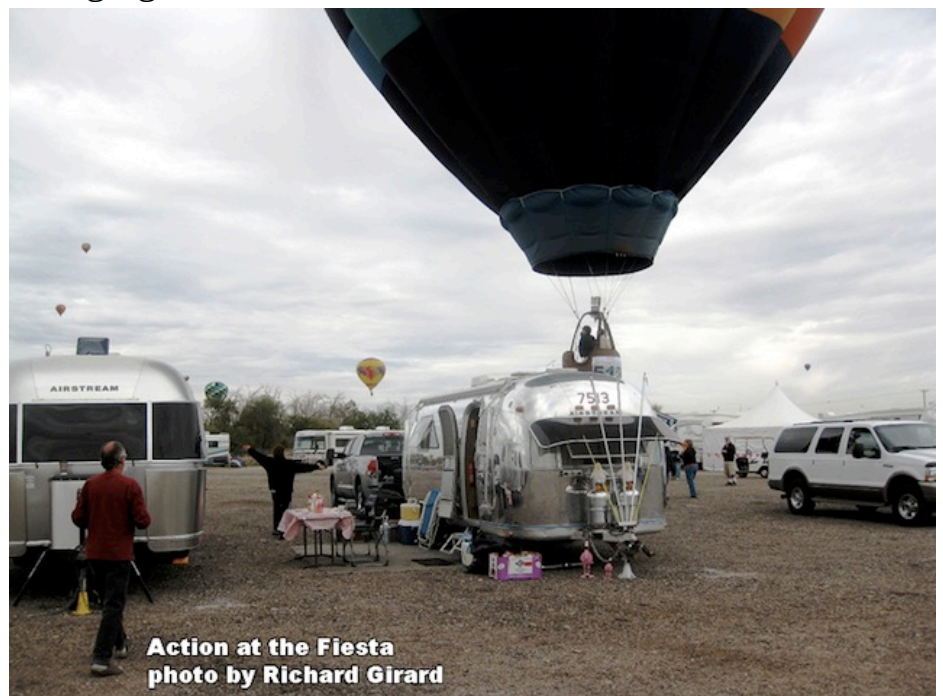
Action at the Fiesta